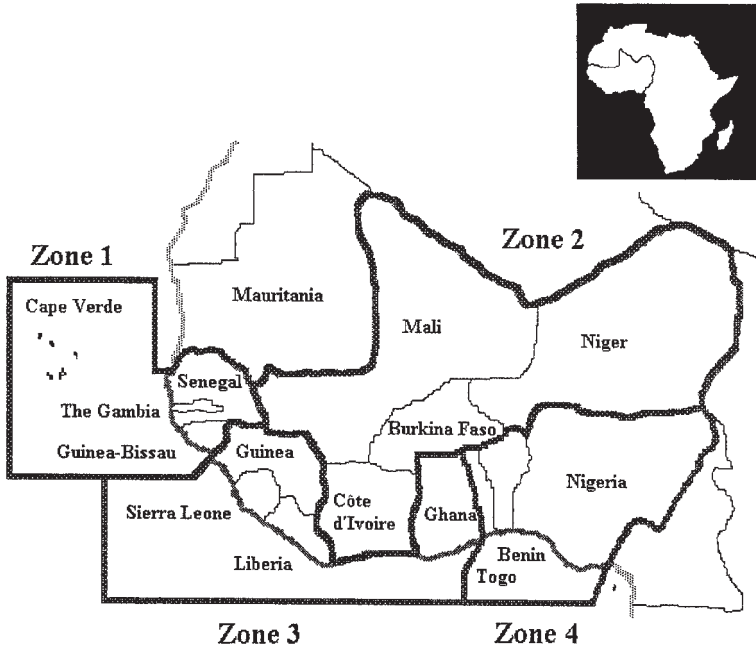
Map 1: Four Observation and Monitoring Zones

(Burkina Faso, Côte d'Ivoire, Niger, and Mali); Zone 3 (Guinea, Sierra Leone, Liberia, and Ghana); and Zone 4 (Benin, Nigeria, and Togo) (see Map 1). Each OMZ has a Zonal Bureau at a zonal capital to collect information on security matters, and these Zonal Bureaux channel their reports to the Observation and Monitoring Centre at the headquarters in Abuja. 23